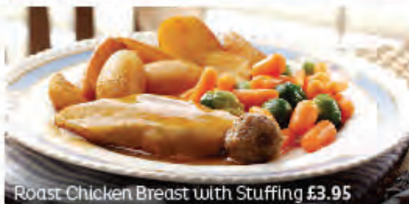
Roast Chicken Breast with Stuffing £3.95

Feel free to try our range, perhaps one of our taster packs with no more obligation than to enjoy it!